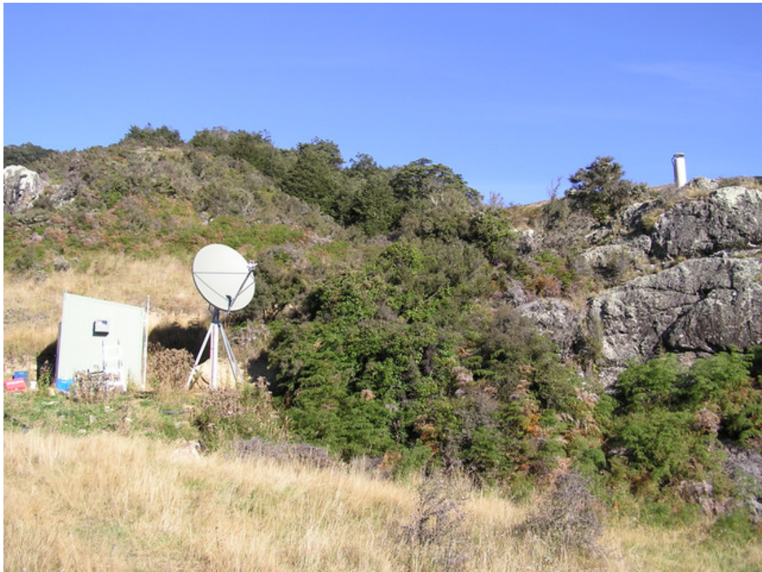
Figure 2. A photograph of the NZNSN station MLZ showing the VSAT dish (on left) and equipment hut (far left). The sensor vault is located behind the rock outcrop to the right, and a GPS monument can be seen at the top of the rock outcrop.