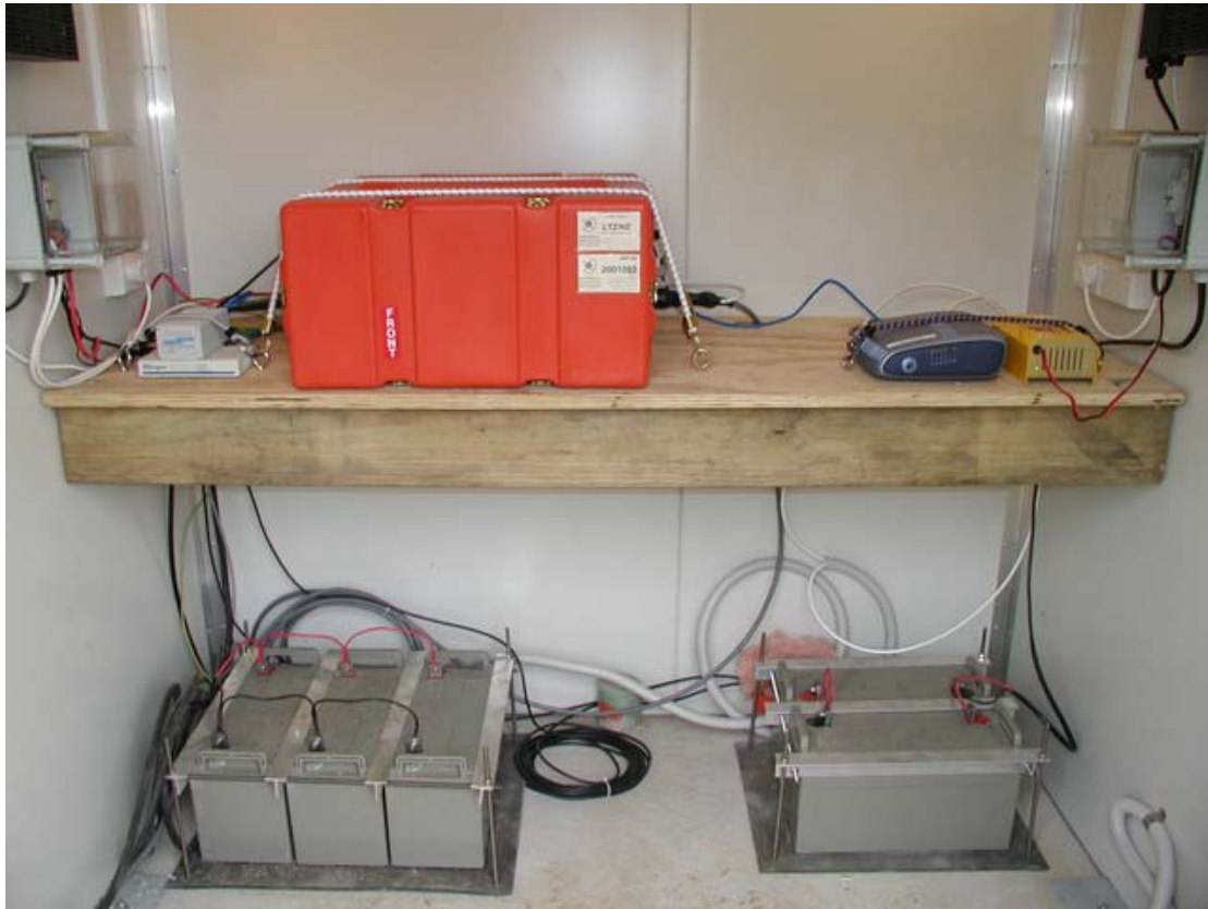
Figure 4. A photograph of the inside of a NZNSN equipment hut showing the orange Quanterra Q4120 to the left and the VSAT indoor unit to the right on the bench. The digitiser and VSAT communications equipment have separate power supplies with backup batteries on the floor of the hut. This site also records the data from a CGPS station (using a Trimble NetRS) via a Freewave Ethernet Bridge radio to the left of the Quanterra.