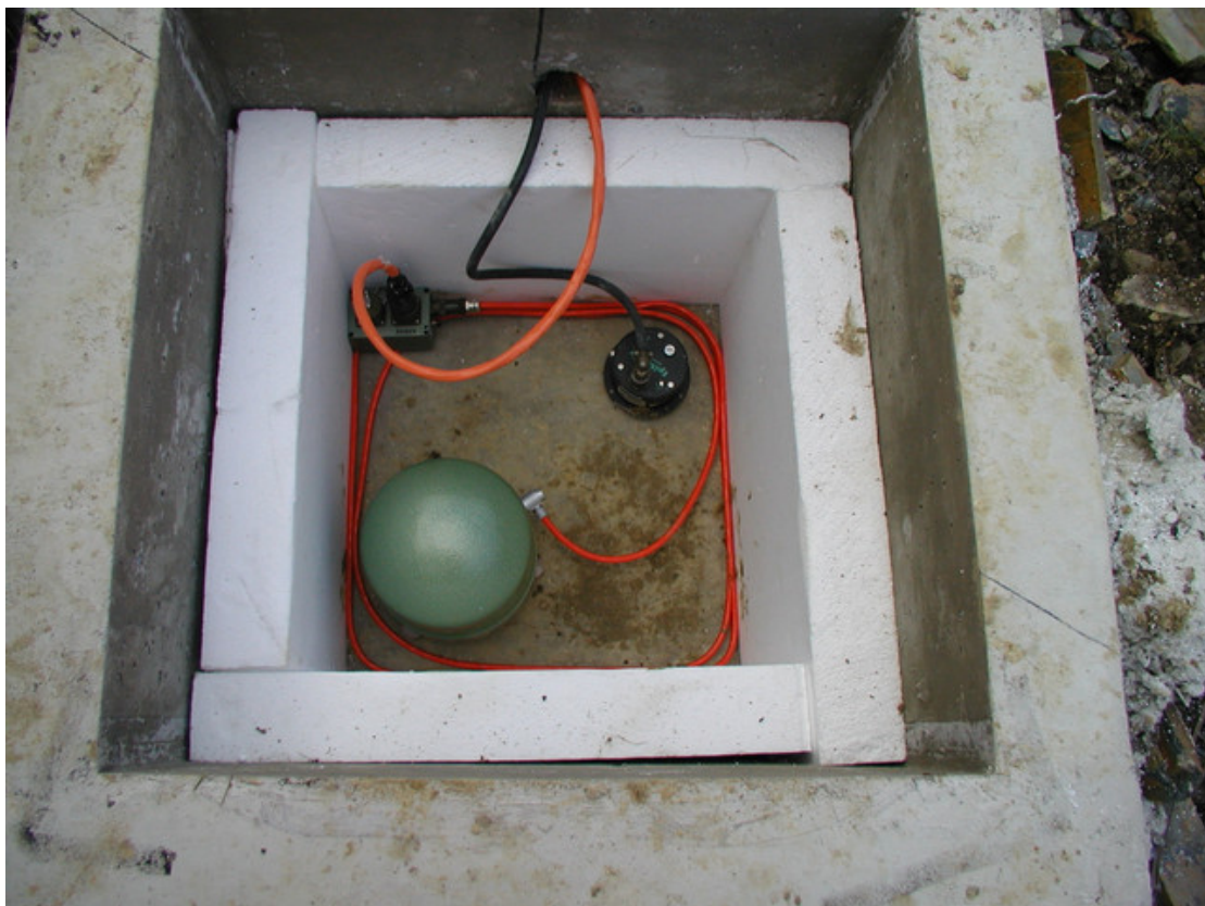
Figure 3. A view of a NZNSN vault with a Streckheisen STS2 broadband seismometer and Kinematics Episensor installed.